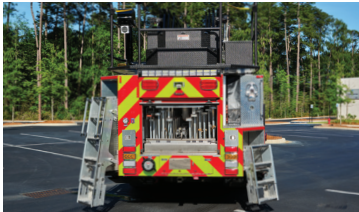
Safe egress from the turntable on each side of the body.