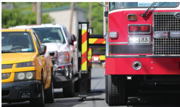
Short outrigger stance allows for setup on the tightest streets.