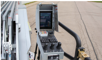
Advanced motion control system provides the smoothest device operation.