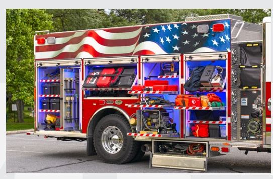
SPACIOUS COMPARTMENTATION OFFERING UP TO 550 CUBIC FEET OF SPACE.

The pumphouse is minimized to consume less space, while the pump controls are placed in an ergonomic location for simplified operations. The PRO is available in a traditional sidemount configuration, or in an elevated sidemount configuration which places the operator up out of the street for safer operation with improved visibility.